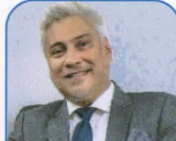
Juan Miguel F. Zubiri Senate Majority Leader