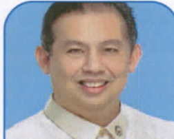
Ferdinand Martin G. Romualdez House Majority Leader