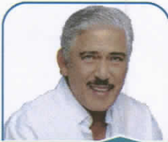
Vicente C. Sotto III Senate President