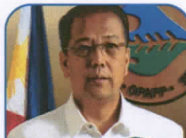
Sec. Carlito G. Galvez, Jr. OPAPP