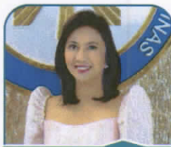
Vice President Maria Leonor G. Robredo