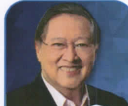
Sec. Carlos G. Dominguez DOF