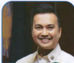
Lord Allan Jay Velasco Speaker of the House