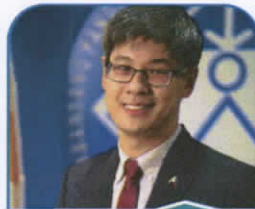
Sec. Karl Kendrick T. Chua NEDA