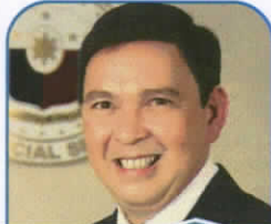
Ralph G. Recto Senate President Pro-tempore