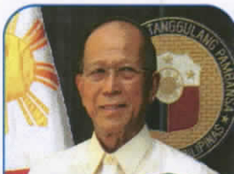
Sec. Delfin N. Lorenzana DND