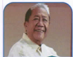
Sec. Arthur P. Tugade DOTr