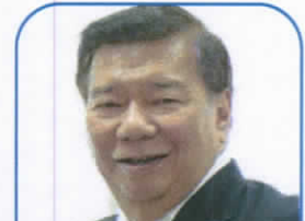
Franklin M. Drilon Senate Minority Leader