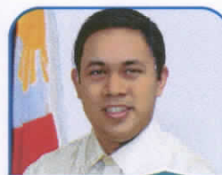
Sec. Mark A. Villar DPWH