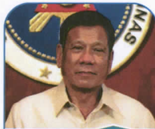
President Rodrigo R. Duterte Chairman