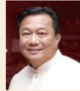
Pantaleon D. Alvarez Speaker of the House of Representatives (July 25, 2016–May 21, 2018)