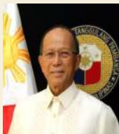
DND Secretary Delfin N. Lorenzana