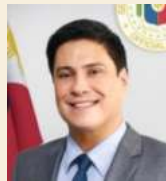
Juan Miguel Zubiri Majority Leader