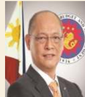
DBM Secretary Benjamin E. Diokno 1