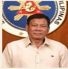
PRESIDENT RODRIGO R. DUTERTE Chairman