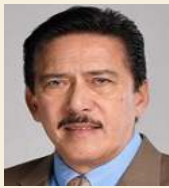
Vicente C. Sotto III Senate President (July 23, 2018–June 30, 2019)