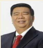
Franklin M. Drilon Senate President Pro-tempore