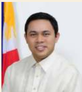
DPWH Secretary Mark A. Villar