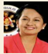
Gloria Macapagal-Arroyo Speaker of the House of Representatives (May 21, 2018– June 4, 2019)