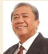
DOTr Secretary Arthur P. Tugade