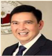
Ralph G. Recto Senate President Pro-tempore