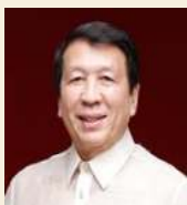
Rodolfo C. Fariñas Majority Floor Leader