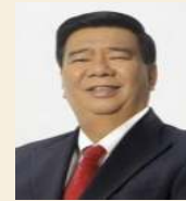
Franklin Drilon Minority Leader