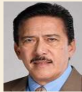
Vicente C. Sotto III Majority Leader