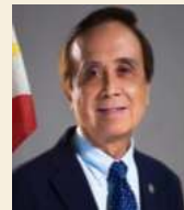
NEDA Secretary Ernesto M. Pernia