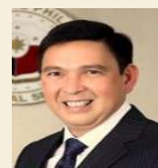
Ralph G. Recto Minority Leader