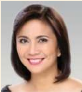
Vice President Maria Leonor G. Robredo