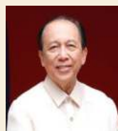
Danilo E. Suarez Minority Floor Leader