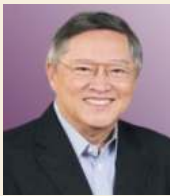
DOF Secretary Carlos G. Dominguez