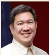
Rolando Andaya, Jr. Majority Floor Leader